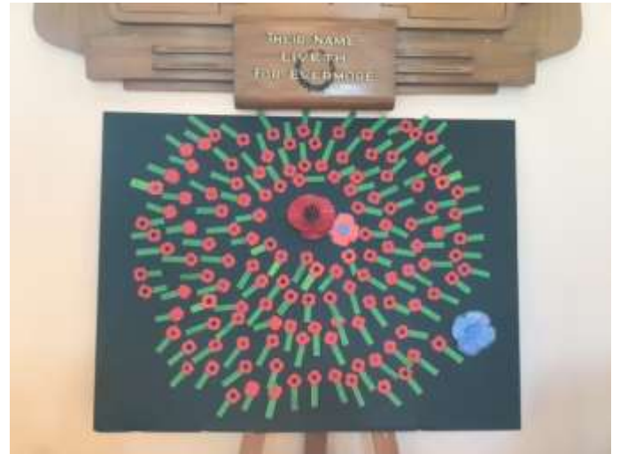
Poppies made by the congregation at the Celebration Service on Anzac Day