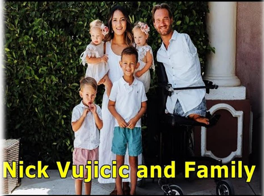
Nick Vujicic and Family