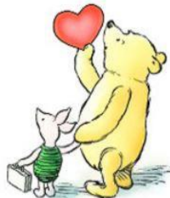
Winnie the Pooh

“Sometimes the smallest things take up the most room in your HEART ”